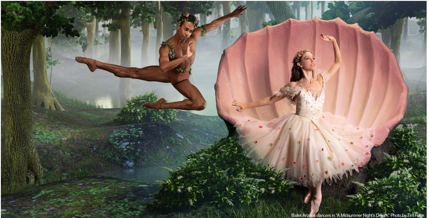
Ballet Arizona dancers in "A Midsummer Night's Dream."